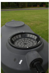
400mm Leaf Sieve