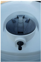
455mm Screw Access Lid