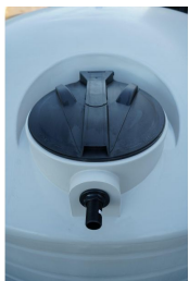
455mm Screw Access Lid