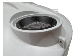
500mm Leaf Sieve