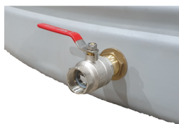
50mm Outlet and Ball Valve