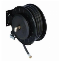
10m Hose Reel Vertical Mount 25mm