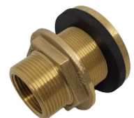
25mm Brass Tank Fitting