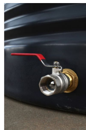
25mm Ball Valve Tap