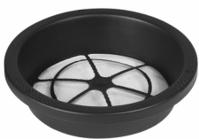
300mm Leaf Sieve