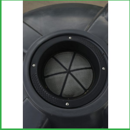
200mm Leaf Sieve