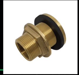
25mm Brass Tank Fitting

ENVIROFORM lia POLY AGRICULTURAL SOLUTIONS